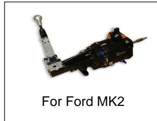
For Ford MK2